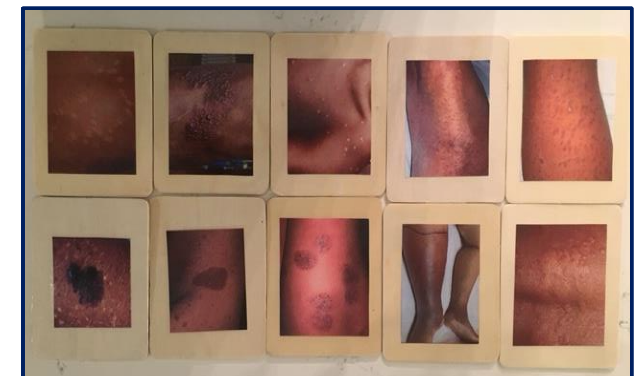
Figure 1. Simulated wounds